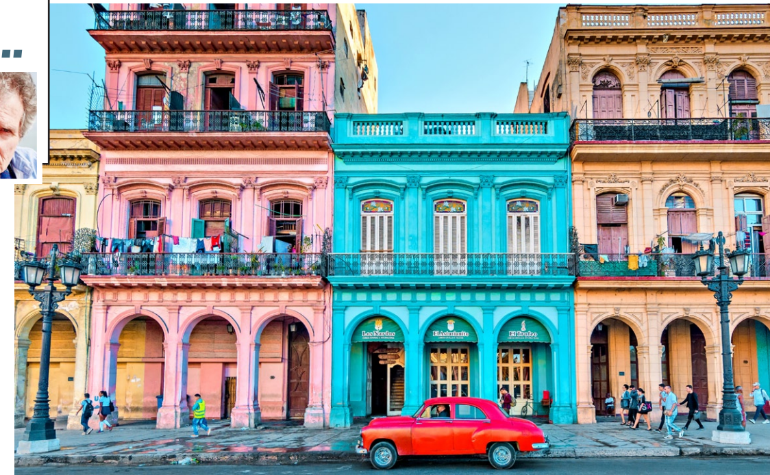
Shabby chic: Cuba's colourful capital Havana is known for its captivating architecture

AS A boy, going to Trevone Bay in Cornwall, where my father had met my mother. We rented a bungalow near the